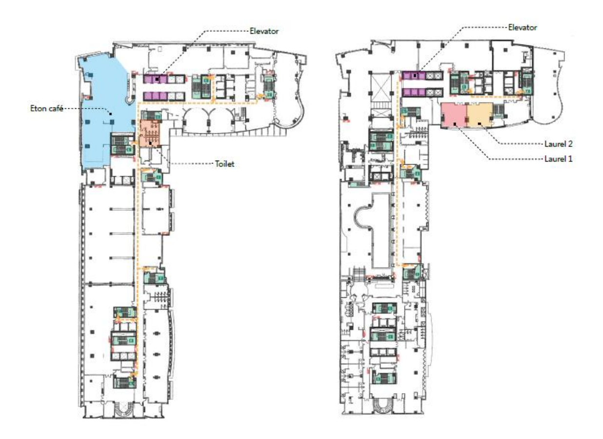
The 4th floor plan

Registration: Pre-Function Area, 4F Oral Session: Laurel 1 and 2, 4F